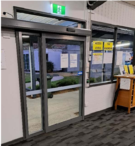
Main Clubroom entrance door.