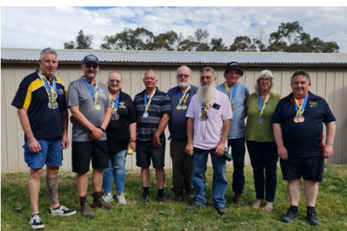
The Victorian medal winners

The prone event was shot first over 2 squads on benches, with benchrest following with 3 squads. 20m was held on the Saturday and 50m on the Sunday. Air rifle was a walk up start over both days.