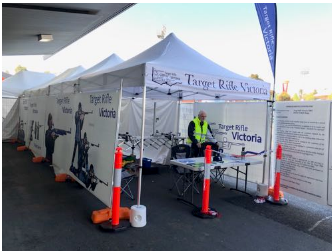
Some grey haired old bloke looking a bit lost?

If you look at the pictures you probably will recognise some of our TRV members. (including the editor!!)