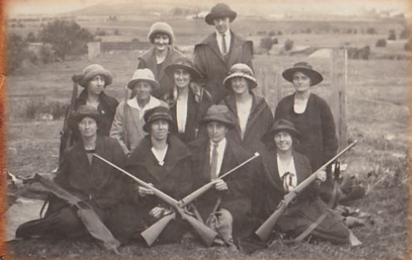
Commonwealth Ladies Rifle Club circa 1930

Like many sports, club membership has faced challenges in recent years. Now is the time to fanfare the sport and, as our DNA demands, sound the bell for increased membership, active participation and ever increasing confidence in our plans for the future.